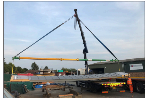
Offsite - lifting of assembled roof onto crane for transportation to site for final installation by USL Ekspan

The refurbished footbridge with the coloured glass panels has been well received providing a more modern fresh look.